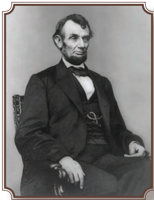
A 1864 photograph of President Lincoln